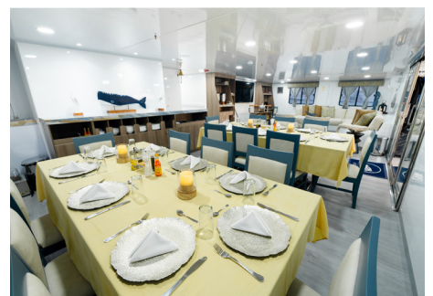
The Anahi - Galápagos Island